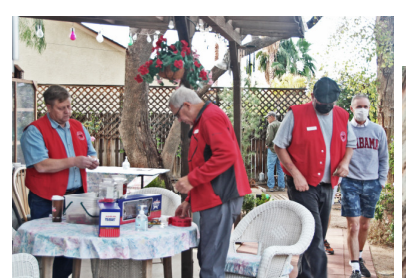
Meeting